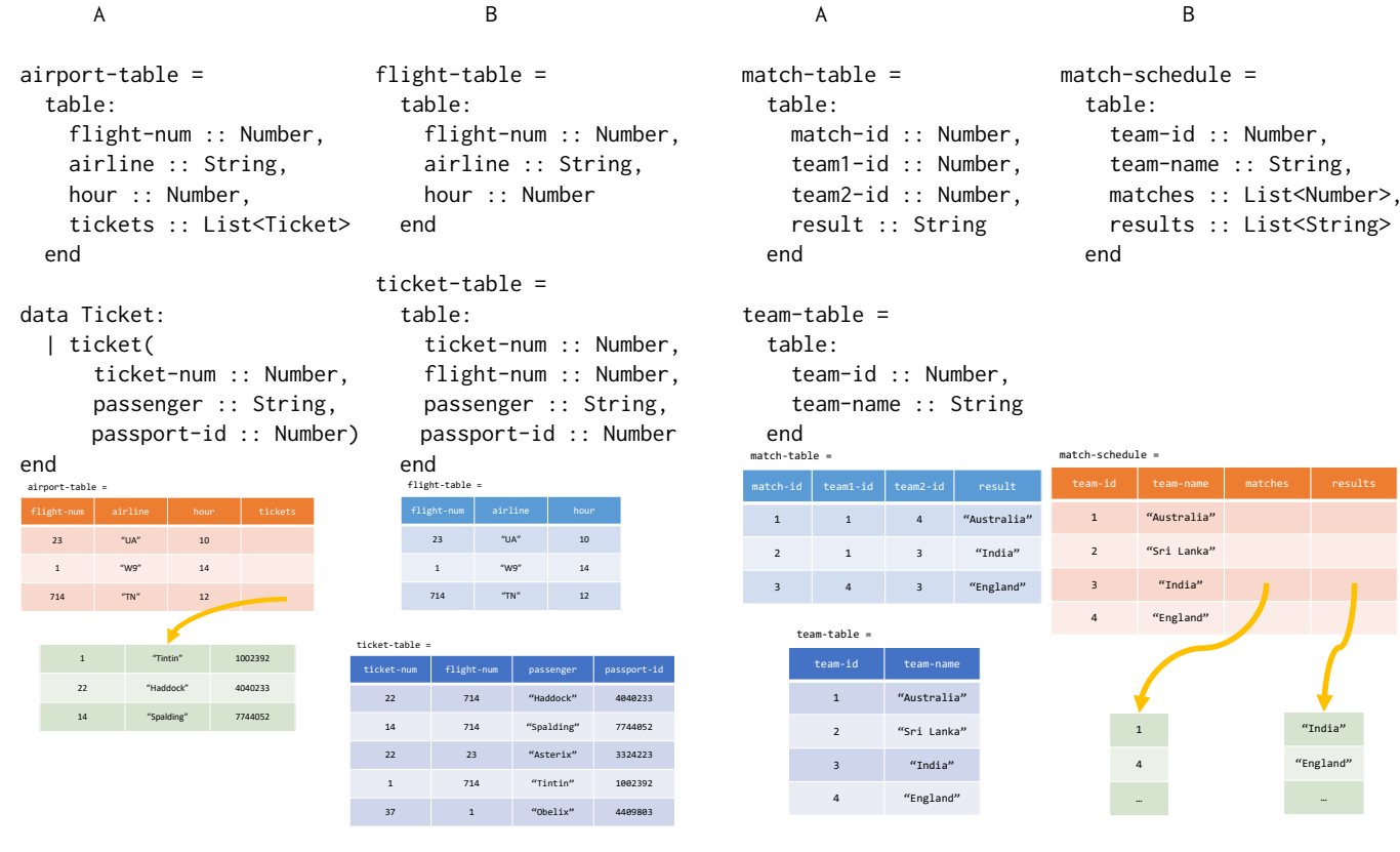
Figure 1: TRAVEL Data Organizations