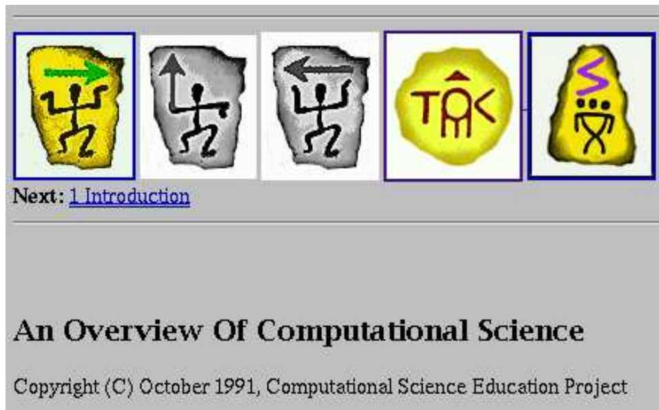
Figure 2: A sample figure showing part of a page generated by \text{\LaTeX2HTML} containing a customised navigation panel (from the CSEP project 36 ).

\begin{figure} \htmlimage{thumbnail=0.5} \htmlborder{5} \centering \includegraphics[width=5in]{psfiles/figure.ps} \latex{\addtocounter{footnote}{-1}} \caption{A sample figure showing part of a page generated by \latextohtml{} containing a customised navigation panel (from the \htmladdnormallink {CSEP project\latex{\protect\footnotemark}} {http://csep1.phy.ornl.gov/csep.html}).}\label{fig:example} \end{figure} \latex{\footnotetext{http://csep1.phy.ornl.gov/csep.html}}